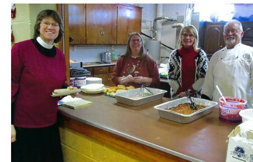
Serving at Hephatha Lutheran Church.