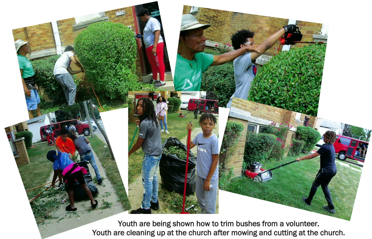
Youth are being shown how to trim bushes from a volunteer. Youth are cleaning up at the church after mowing and cutting at the church.